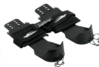
Flexfoot Heel restraints and solid heels for safety, rounded heels for a good fit. Approved by USRowing and British Rowing.