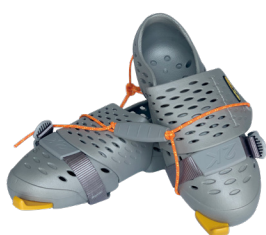
Active Tools adjustable shoes 2 sizes available: 40-45 and 43-48