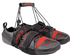
Bont Rowing shoes Sizes 36-53 available, but they are smaller than normal, so order 1 or 2 sizes larger.