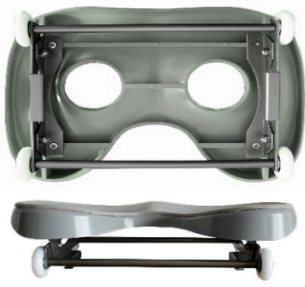
Plastic seat top for Club B

Club B boats are supplied with moulded plastic seat top.