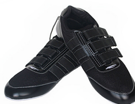
Swift Racing shoes Sizes 37-54 available