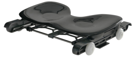
B. Double action type (add extra 220g per seat)