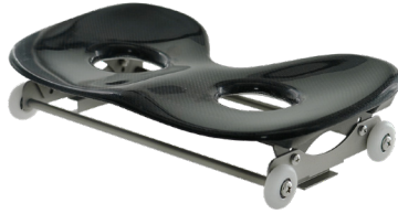
A. Single action type with bearings, height adjustable.

Elite and Club A boats are supplied with lightweight carbon seat tops.