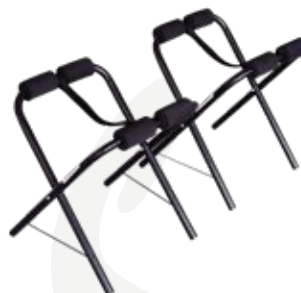
Steel trestles (simple for 1s & 2s)