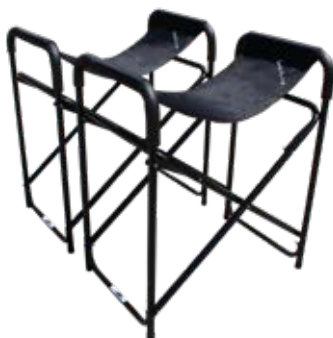
Steel trestles (small for 1s & 2s)