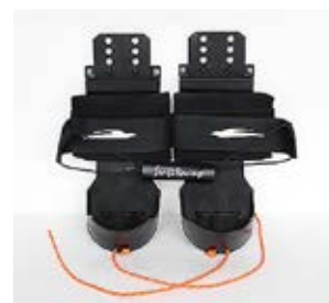
Heel restraints and solid heels for safety, rounded heels for a good fit. Approved by USRowing and British Rowing.