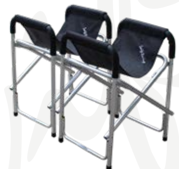
Aluminium trestles (small for 1s & 2s)