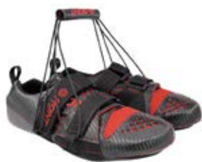
Bont Rowing shoes Sizes 36-53 available, but they are smaller than normal, so order 1 or 2 sizes larger.