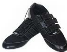
Swift Racing shoes Sizes 37-54 available