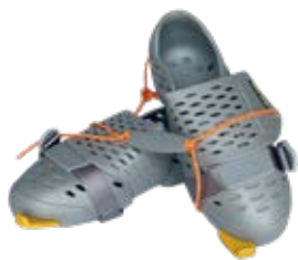
Active Tools adjustable shoes 2 sizes available: 40-45 and 43-48