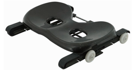
B. Double action type (add extra 220g per seat) (SeaD1)