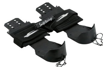
Flexfoot Heel restraints and solid heels for safety, rounded heels for a good fit. Approved by USRowing and British Rowing.