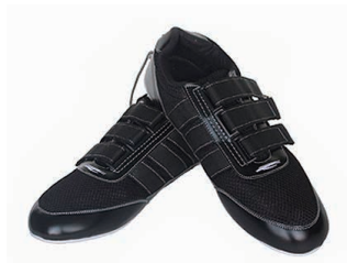
Swift Racing shoes Sizes 37-54 available