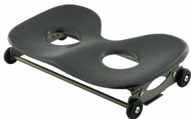
Single action type with bearings, height adjustable (Sea33B-c).

All boats are supplied with lightweight carbon seat tops.