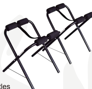
Steel trestles (simple for 1s & 2s) (Tre44cmB)