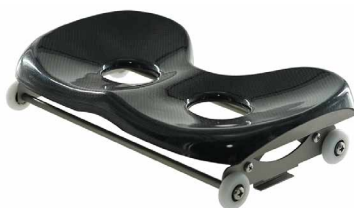
A. Single action type with bearings, height adjustable. (Sea2)

Elite and Club A boats are supplied with lightweight carbon seat tops.