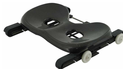
B. Double action type (add extra 220g per seat) (SeaD1)