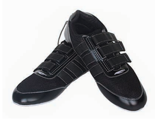
Swift Racing shoes Sizes 37-54 available