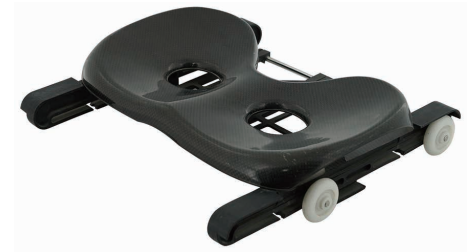
B. Double action type (add extra 220g per seat) (SeaD1)