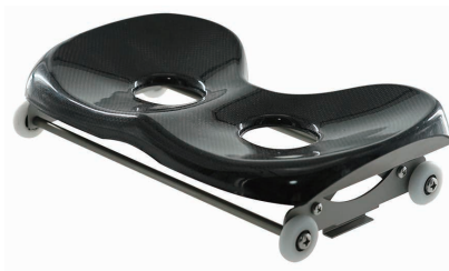
A. Single action type with bearings, height adjustable. (Sea2)

Club A boats are supplied with lightweight carbon seat tops.