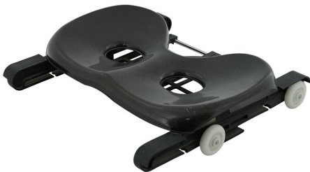
B. Double action type (add extra 220g per seat) (SeaD1)