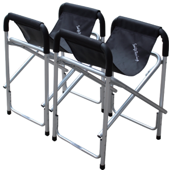
Aluminium trestles (small for 1s & 2s)