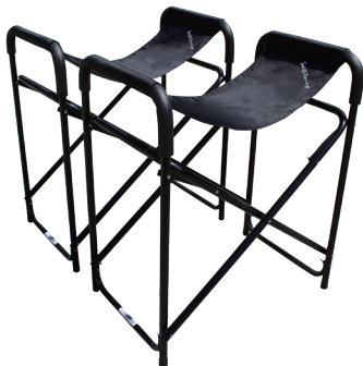
Steel trestles (small for 1s & 2s)