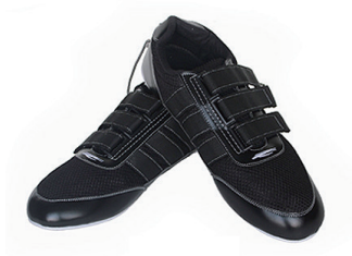
Swift Racing shoes Sizes 37-54 available