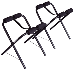
Steel trestles (simple for 1s & 2s)