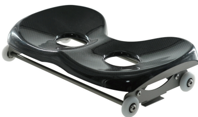
A. Single action type with bearings, height adjustable. (Sea2)

Club A boats are supplied with lightweight carbon seat tops.