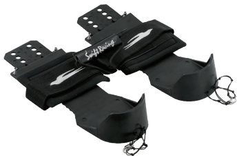
Flexfoot Heel restraints and solid heels for safety, rounded heels for a good fit. Approved by USRowing and British Rowing.